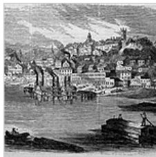
Disunion: Premonition at Vicksburg