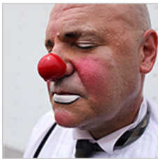
The Artists and Oddballs Under a Tent