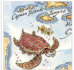
A Guide to the Caribbean on a Budget