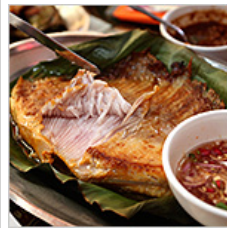
Chasing Stingray All Over Town